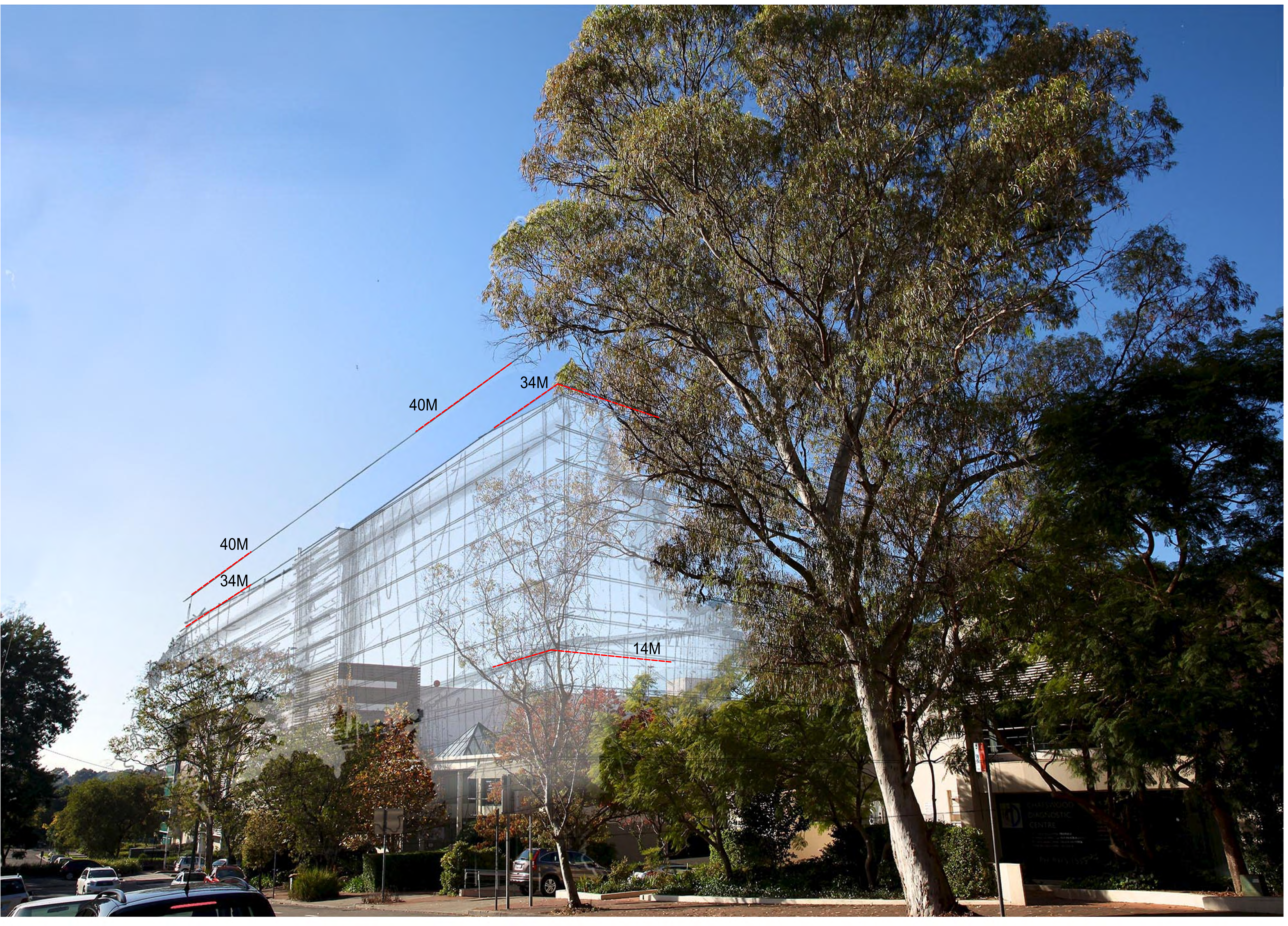
VIEW 2 MALVERN AVENUE LOOKING SOUTH EAST